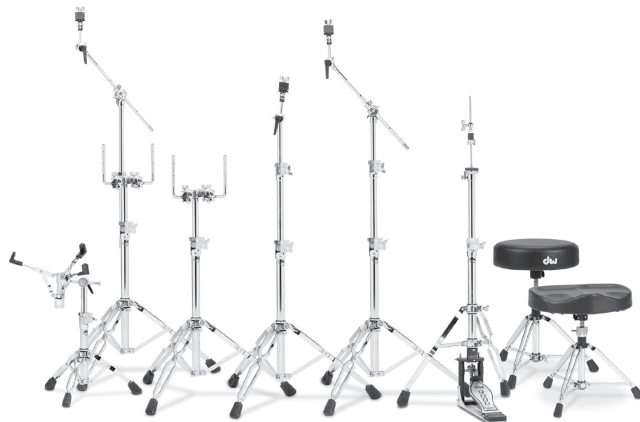
9300 snare drum